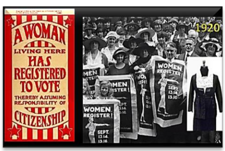
Pictures Used by permission from the State Historical Society of Missouri.