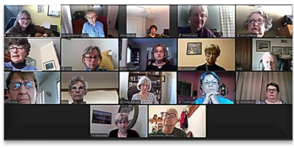
Searcy-Feely collected $670 for our VAC family.