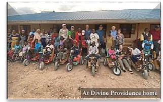
Disabled children who are residents of the Devine Providence Home are recipients of mobility carts.