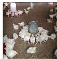
21-day-old chicks at the Poultry Project